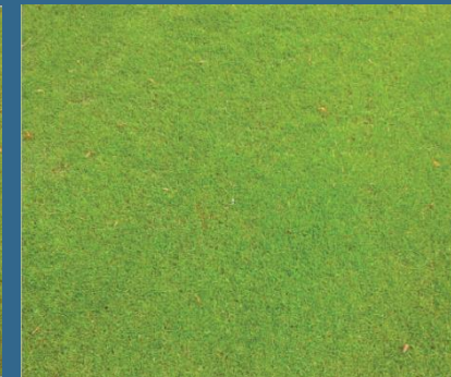
12 weeks later